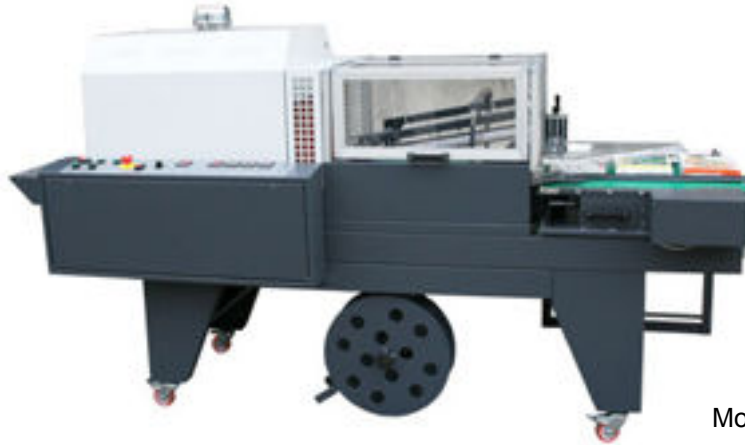
Mod. Dynamic 5038 MB

The automatic L-sealer line with two independent conveyors, is complete of sealing station and shrink tunnel, mounted on one metallic framework, treated and varnished with epossidic powder.